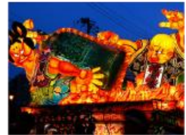
Sendai Tanabata Festival